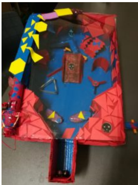
Figure 1. A cardboard pinball machine constructed by a student.

Marna incorporated a set of student-chosen science fair investigations about the forces in rubber bands, angles of ramp elevation, and friction on different surfaces.